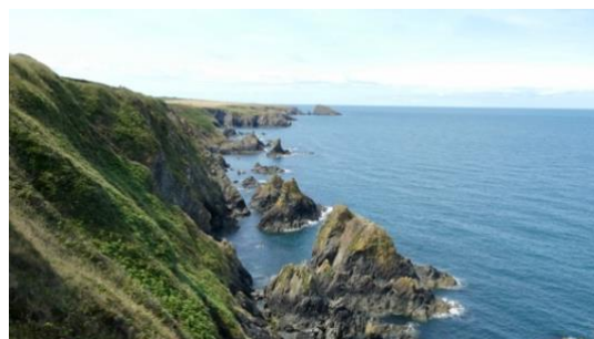
Beautiful Pembrokeshire coastline.