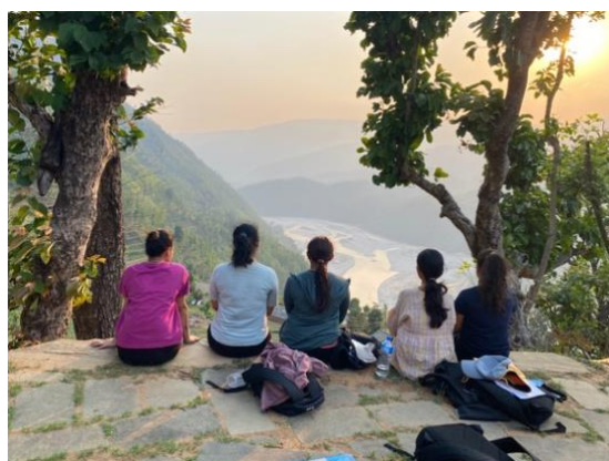
Researchers relax after a busy day collecting data in Rukum District

Research and training continued apace while we were in the UK. Nurses appointed to the rural hospitals received six weeks of intensive training here in the Palliative Care (PC) Centre at Green Pastures, Pokhara, while the research team, having completed data collection in Rukum, returned to another part of Lamjung to complete 150 house-to-house questionnaires and selected follow-up visits.