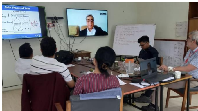
Palliative Care training for rural hospital doctors, at Green Pastures Hospital, Pokhara.

management, has expressed desire to remain part of this programme, so the second week involved taking the doctors to Besisahar, for clinical teaching, to contextualise their learning in the rural hospital setting. This was a very fruitful time as they really seemed to catch the vision for what is possible; One of the doctors said, "I now realise palliative care is appropriate for many of our patients, not just those with cancer."